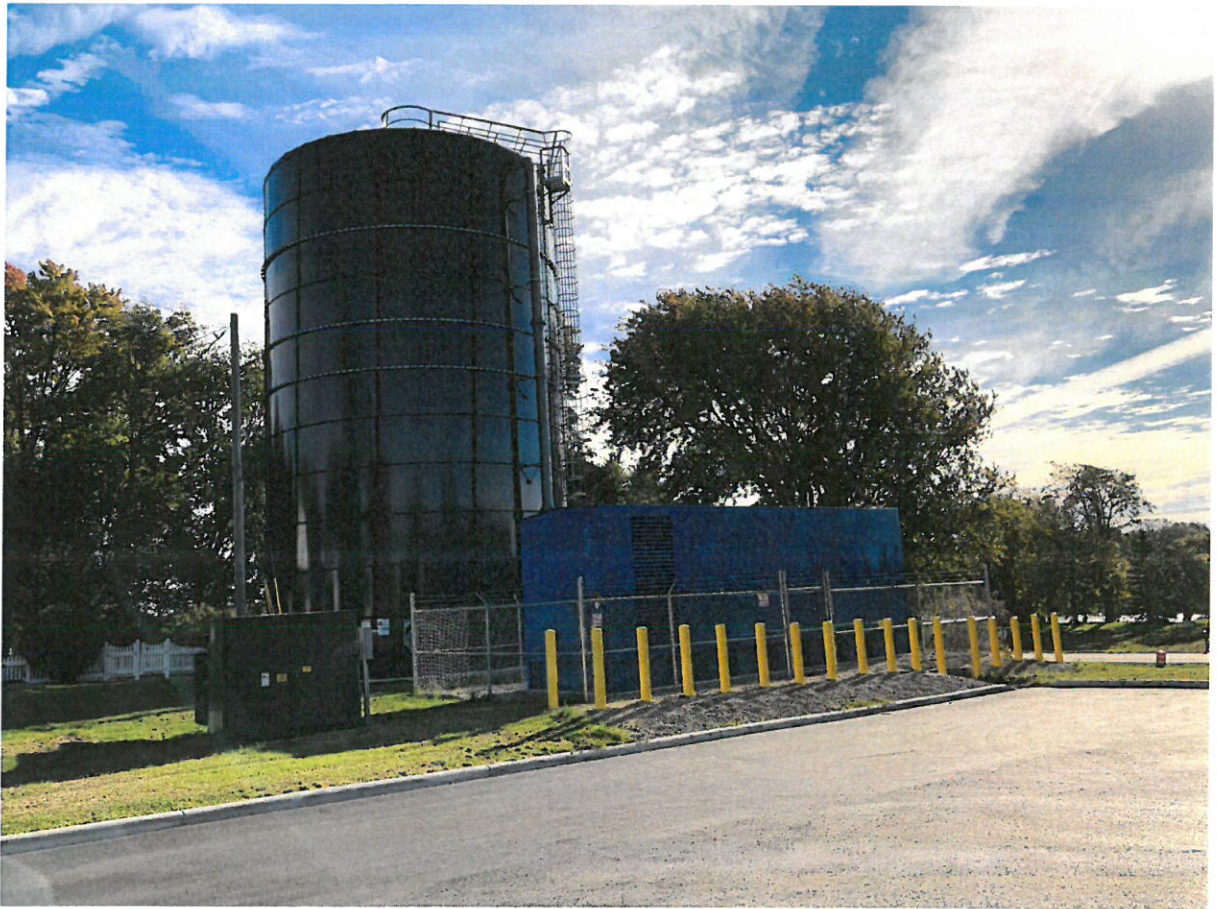
Water Treatment Plant Generator