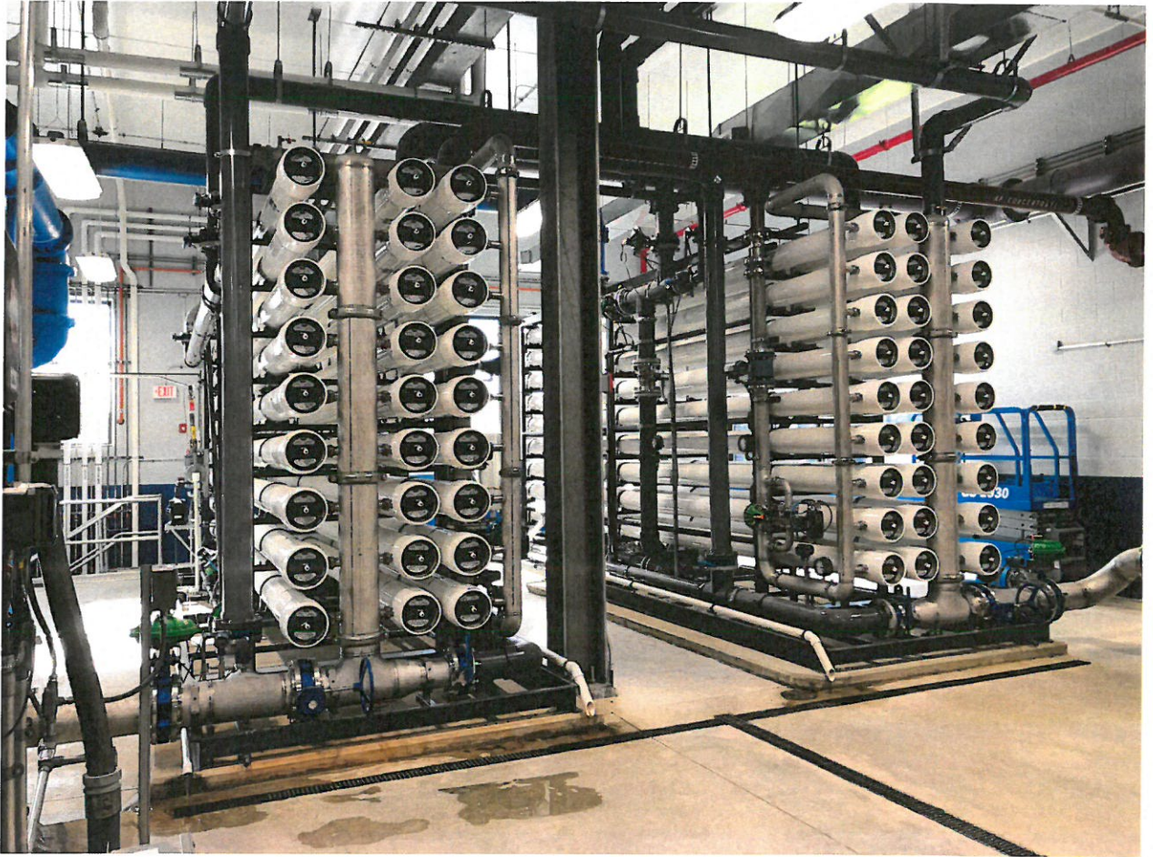
Water Treatment Plant Napoleon Membranes