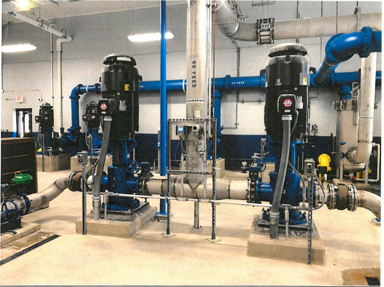
Water Treatment Plant RO and Nano Pumps